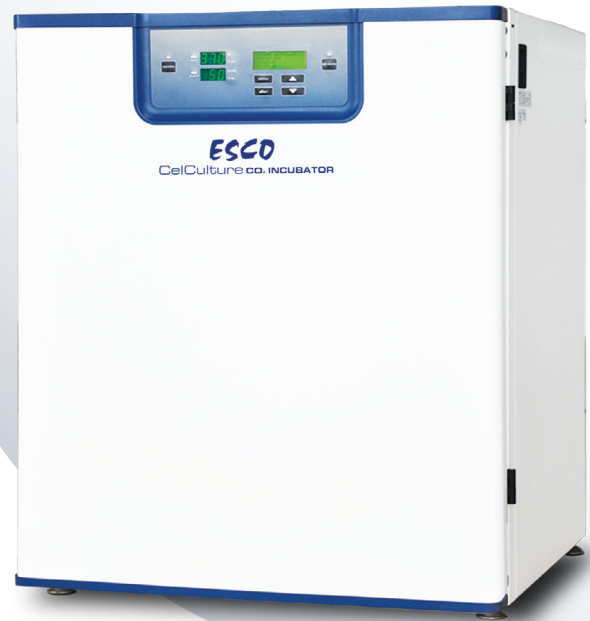
CelCulture® CO 2 Incubators are available in 3 sizes, 50 L, 170 L, and 240 L.